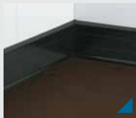
Reinforced floor 9 mm