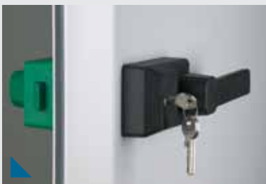
Door handle with lock and emergency release