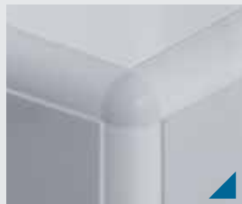
Inner rounded corners