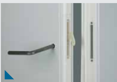
Tongue-and-groove with integrated locking system