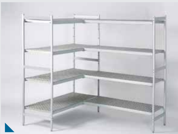
Racks with four shelves