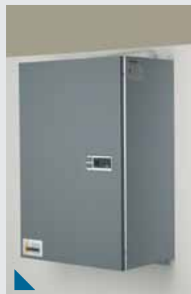
Compact cooling unit